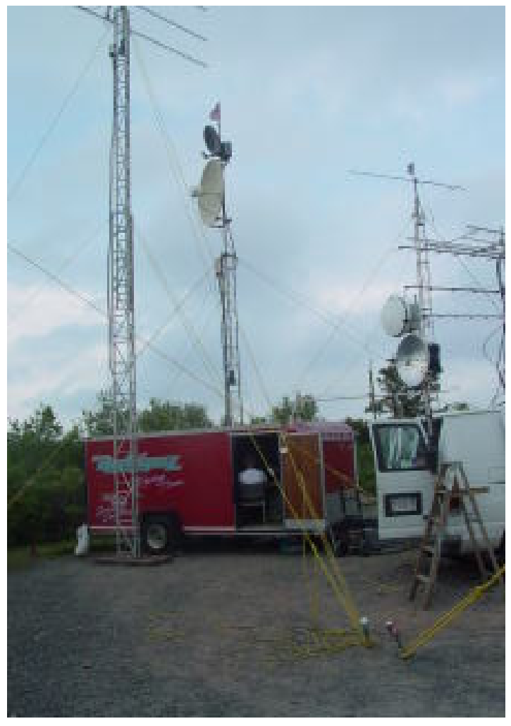
Microwave trailer and K1DS Add-on Rover

but thanks to the clip-on blinkers and covers to the stakes there were no injuries. There were winds and storms each night, but thanks to use of good jackhammer and guying, all the antennas and towers stayed erect. There were only six rats scheduled to help load at the barn, but mercifully additional hands appeared, and they were augmented by more at the mountain for set-up. And similarly, when we were all exhausted Monday morning, with little energy to dissemble and repack it out, a few additional folks joined the team to get us off the mountain about 12:30. We were all tired and seemingly hungry and thirsty all weekend long, but due to the diligence and effort by Doc, we all had full cups and bellies. and K1DS